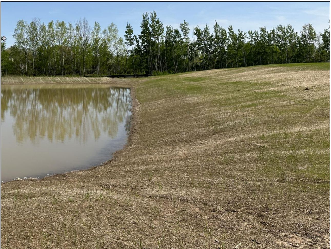
Figure 5. Evidence of seed migration from a straw ECB installation surrounding an on-site sediment retention pond.

Depending on its Manning's n value, an ECB's fiber type can either have an increasing or decreasing effect on the energy of sheet flow. Manning's n is a measure of a product's hydraulic roughness, and a higher Manning's n helps decrease energy, slow water flow, increase water infiltration, and keep the underlying seed and soil in place. Straw fibers have a lower Manning's n than other ECB fibers, such as aspen excelsior.