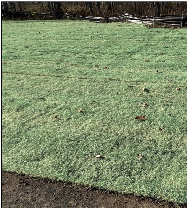
Figure 7. Curlex II QuickGRASS installation.

Curlex® II QuickGRASS® (see Figure 7) was used on most of the flatter and shallow-sloping curbside and inland areas following the failures of the other BMPs. Curlex fibers' ability to create a "greenhouse effect" when exposed to moisture fosters favorable seed germination and establishment conditions. Curlex® II FibreNet™ was installed on many of the roadside slopes near the sediment retention ponds and wetlands (see Figure 8). It provides all the features and benefits of other Curlex products while encasing the Curlex fiber matrix between two layers of 100% biodegradable jute netting with non-welded slip joints.