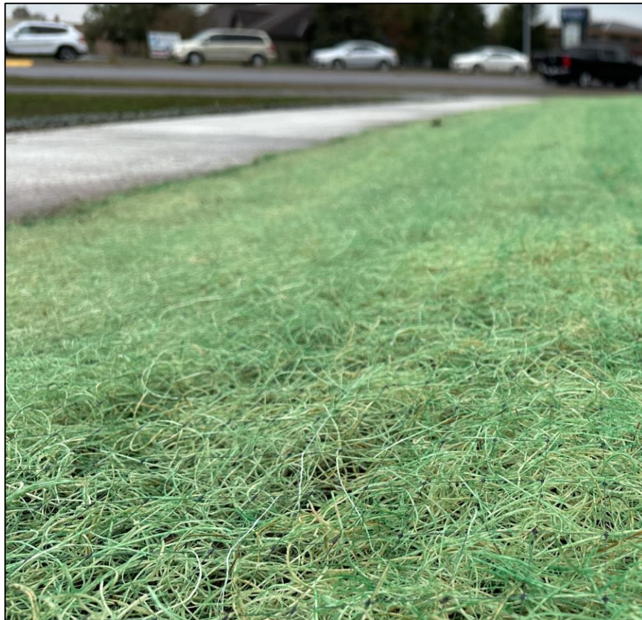
Figure 1. An erosion control blanket (ECB), Curlex® II QuickGRASS®, installed on a newly constructed section of the project area.

A 60-acre (24-hectare) project involving utility upgrades, road resurfacing, and sidewalk installation began in early spring in an area of Wisconsin that experienced sporadic precipitation events. Therefore, the appropriate selection and placement of erosion control Best Management Practices (BMPs) was paramount to both the visual appeal and overall success of the project (see Figure 1).