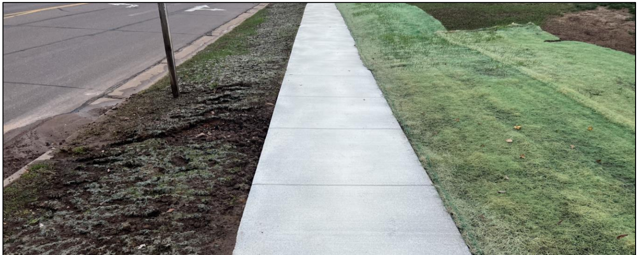
Figure 6. Curlex II QuickGRASS installed opposite the hydraulic mulch installation shown in Figure 4.

Engineered Curlex fibers are made from Great Lakes aspen trees. Curlex expands and contracts with moisture, allowing the curled and barbed fibers to form a “Velcro-like” connection that conforms to irregularities in the soil. Curlex fibers also have a high Manning’s n value that helps dissipate energy from hydraulic forces (such as sheet flow) for increased water infiltration and enhanced soil and seed bed protection during hydraulic events.