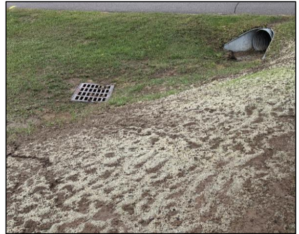
Figure 3. Partial washout of a hydraulic mulch application near a stormwater drain.

The hydraulic mulch was not applied to the curbside areas until mid/late September. Within several days of its initial application, the site experienced two rainfall events. These events led to a partial washout of the hydraulic mulch material (see Figure 3). The washed-out areas saw rills, uneven vegetative growth, and instances of severe erosion (see Figure 4). Some of the eroded sediment washed into the street and reached nearby stormwater drains before site personnel were able to clean up the area. Expenses due to cleanup, buying new BMPs to replace the failed hydraulic mulch, and the re-installation of the new BMPs were all additional unplanned costs to the project.