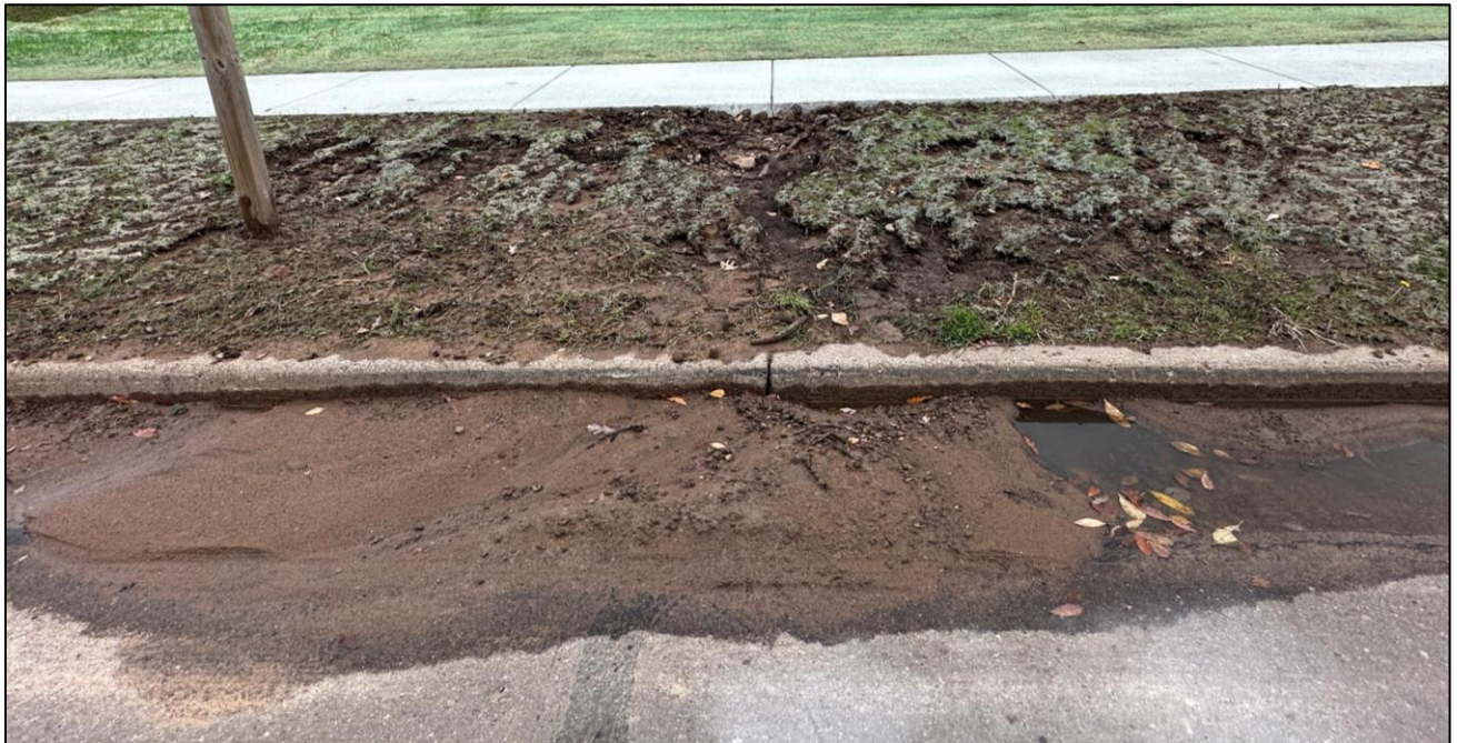
Figure 4. Severe failure of a hydraulic mulch application.

The project could not afford to risk further sediment and nutrient contamination being transported into the stormwater drains, wetlands, or the nearby impaired river. Potential harmful contaminants could include phosphorus, malachite green, and chemicals from fertilizer.