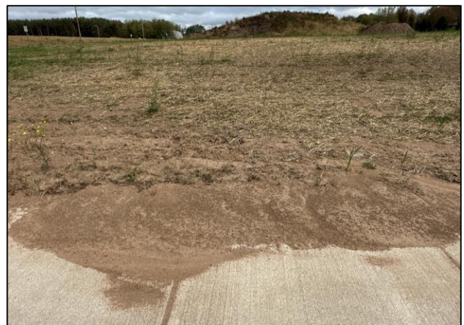
Figure 2. Failed blown straw installation that led to sediment being deposited onto the sidewalk.

Straw fibers lay flat and form bridges over irregularities in the soil. They are hollow and float during hydraulic events. When exposed to sheet flow, the blown straw fibers' characteristics can lead to erosion and partial or complete loss of the seed bed. In this case, sediment was deposited directly onto the sidewalk, which was an eyesore, and its cleanup was an unplanned expense.